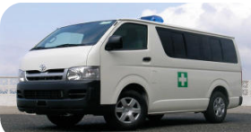
Toyota Hi Ace Ambu