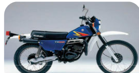
Suzuki TS 185