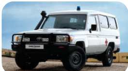
Toyota Hard Top Ambu