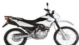
Honda XL 125 & XR 125