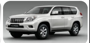
Toyota LC Prado