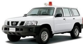
Nissan Patrol Ambu