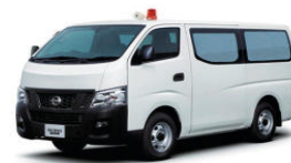
Nissan Urvan Ambu