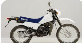
Yamaha DT125 & 175